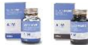
VectorVP & BlackMagic ADM

Vector VP - Vinyl polysiloxane tray adhesive. Silicone tray adhesive in 60 ml bottle, brush in cap ADM-VP60