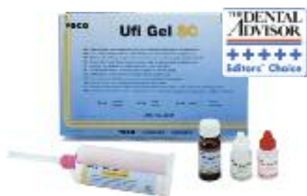
Ufi Gel SC VOCO

A permanent soft A silicone relining material for full or partial dentures and implants. It can also offers superior cushioning of sharp alveolar processes maximising patient comfort.