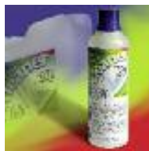
All Cleaner LASCOD

A cleaning fluid for the removal of alginates, plaster and cements from stainless steel, plastic and other alloys instruments and trays.