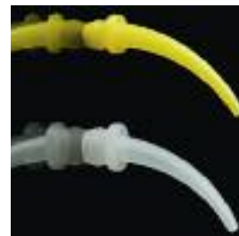
Intraoral Tips White x96 KET17221 Intraoral Tips Yellow x 96 KET17222