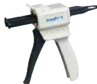
Applyfix Dispensing Gun (1:1 cartridges) KET17203