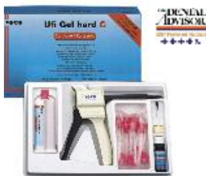
Ufi Gel Hard C VOCO

A direct hard relining material perfectly mixed from the cartridge for simple, time saving and bubble-free application. It is methylmethacrylate-free and has a neutral taste and colour. It is suitable for direct and indirect, total or partial relining, lengthening of denture rims and the repair and enlargement of dentures.