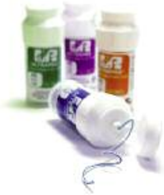
Ultrapak® Retraction Cord ULTRADENT

Ultrapak cord is made of 100% cotton, knitted into thousands of tiny loops forming long interlocking chains. The unique knitted design exerts a gentle continuous outward force following placement as knitted loops seek to open. Ultrapak cord is designed to enhance the ViscoStat/Astringedent and Dento-Infusor Tissue Management Technique; however, conventional techniques using alum, aluminum chloride, etc., are also enhanced when using Ultrapak plain knitted cords, as they carry significantly greater quantities of haemostatic solution than conventional cords.