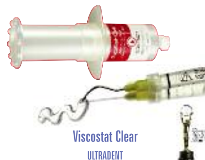
ViscoStat Clear ULTRADENT

ViscoStat Clear is a new generation viscous and spreadable 25% Aluminium Chloride haemostatic gel. The product is ideal to use in the aesthetic zone and quickly stops minor bleeding and sulcular fluid. The gel leaves no residue and rinses off with ease. The direct syringe delivery system provides added convenience in placement and eliminates waste. It is available in four convenient kit configurations.