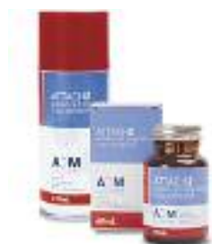
Attach 2 Alginate ADM

Designed to dry quickly when sprayed on impression trays, so that cohesive failure of Attach2 is minimised and the alginate can be placed in the tray almost immediately. No toxic aromatic compounds are used as solvents