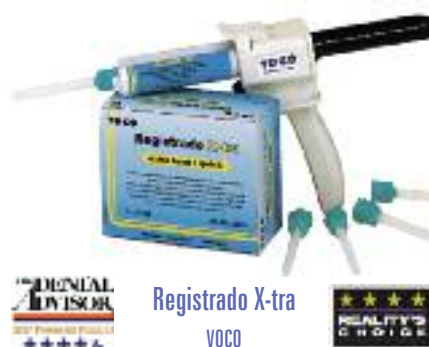
Registrado X-tra VOCO

A highly accurate bite registration material based on A-silicone technology. Featuring highly