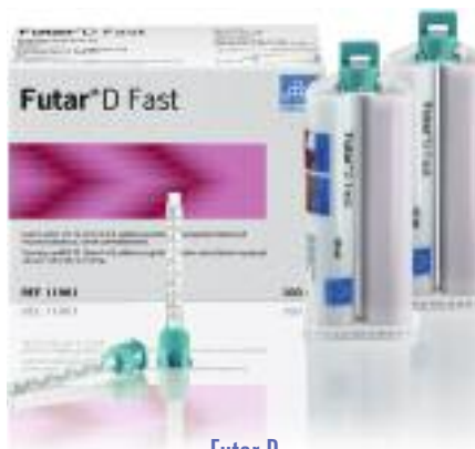
Futar D KETTENBACH

Futar D – extra hard bite registration material with convenient working time, accurate results, no bounce.