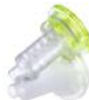
Dynamic Mixer Tips x50 KET17253

Ask your Gunz Dental representative about the Kettenbach Mixing Machine.