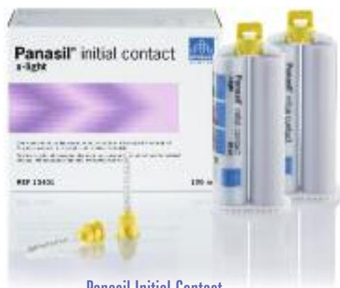
Panasil Initial Contact