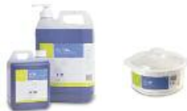
NoAL Alginate Tray Cleaner ADM

Actively removes all alginates, tray adhesives, zinc oxides and most cements from impression trays and instruments. It is non foaming and perfect for ultrasonic cleaners.