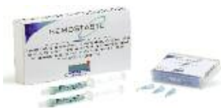
Hemostasyl PIERRE ROLLAND

Haemostatic dressing with mechanical action to stop moderate bleeding and sulcular fluid in all routine dental procedures