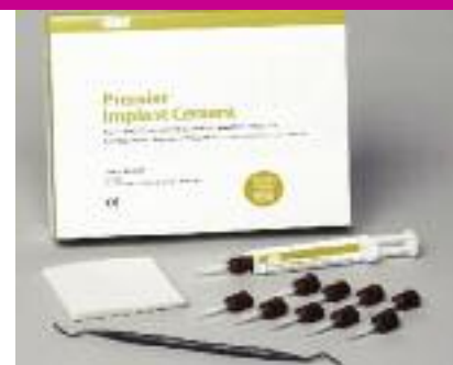
Implant Cement PREMIER

Ideal for long-term temporaries and any implant retained crowns that may require adjustment or re-treatment. With no chemical bonding, crowns can be removed more easily – if needed. Premier Implant Cement will not wash out!