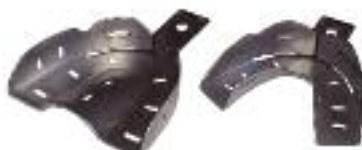
Exploit Trays LASCOD

Set of 6 perforated satin finish, one piece impression trays. Each box contains small, medium and large.