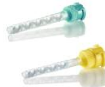
Mixing Tips Green x100 KET17235 Mixing Tips Yellow x100 KET17240