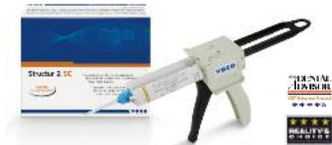
Structur 2 SC