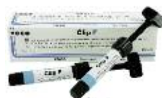
Clip F VOCO

A fluoride releasing Clip. Suitable for temporary fillings, temporary sealing of cavities, especially in inlay/onlay technique.