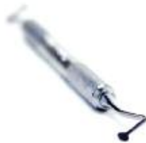
Fisher's Ultrapak® Packers ULTRADENT

These specially designed packers enhance the ease and completeness of packing Ultrapak knitted cord. The slim, slightly serrated heads allow the packer to easily slip the cord into the gingival sulcus.