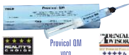
Provicol QM VOCO

Eugenol-free temporary luting cement with calcium hydroxide. For temporary luting of inlays, onlays, crowns, partial crowns, bridges, attachments and posts or temporary filling of small cavities.