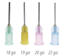
18 ga 19 ga 20 ga 22 ga

Use with: TriAway Adapter, PermaFlo™ DC (20 ga), and other Ultradent syringes.