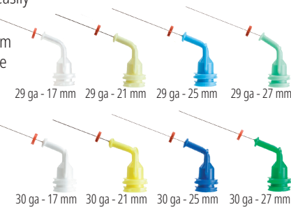
29 ga - 17 mm 29 ga - 21 mm 29 ga - 25 mm 29 ga - 27 mm 30 ga - 17 mm 30 ga - 21 mm 30 ga - 25 mm 30 ga - 27 mm

29 ga delivers paste materials. 30 ga delivers solutions and gels.